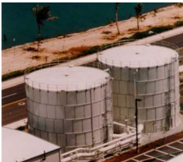
Fire Water Tanks