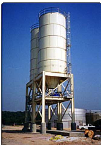
Dry Bulk Storage Silos