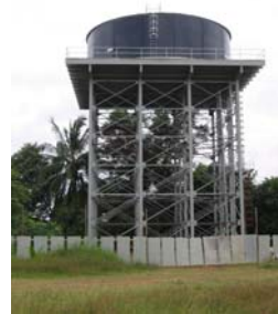
Replacement of FRP/Pressed steel tank